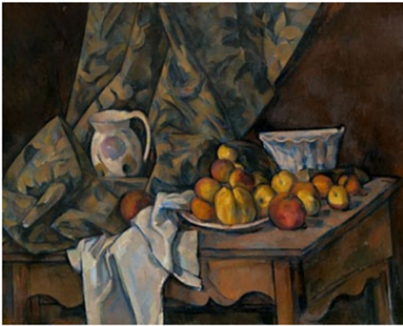
Paul Cézanne French, 1839–1906 Still Life with Apples and Peaches , c. 1905 oil on canvas, 81 x 100.5 cm (31 7/8 x 39 9/16 in.) National Gallery of Art, Gift of Eugene and Agnes E. Meyer