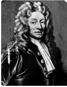
Sir Christopher Wren who designed the houses in London after the Great Fire Of London.