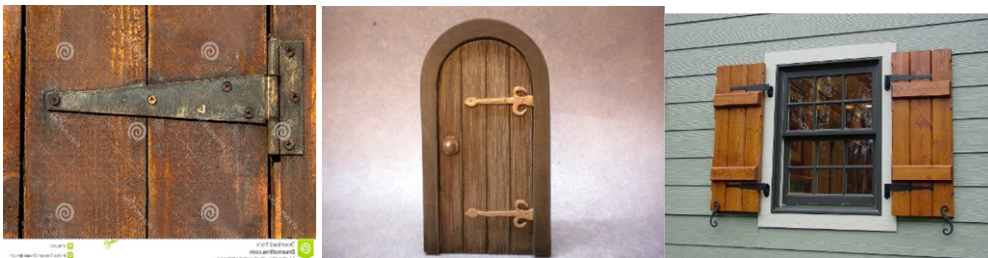
Hinges use don doors and windows