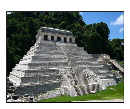
Maya pyramid at Palenque