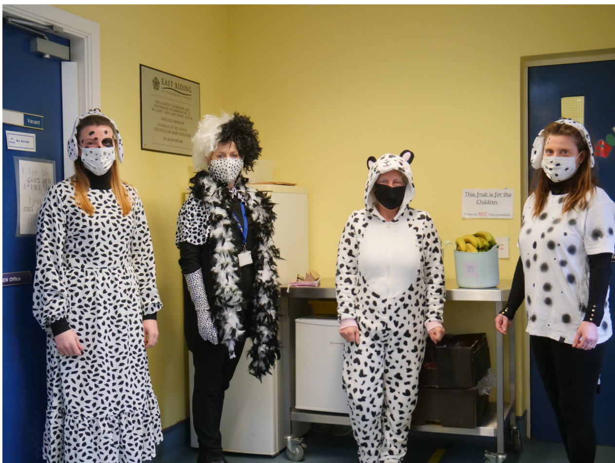
Members of our Inclusion Team on World Book Day (pictured left to right)