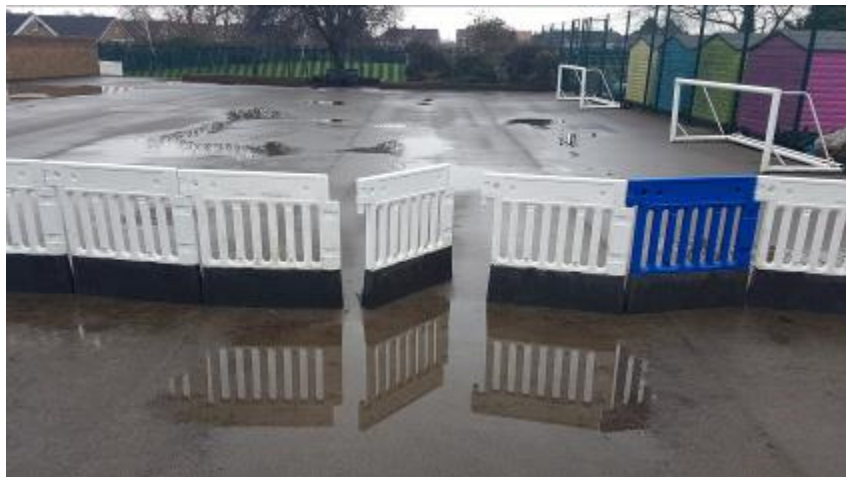
Our existing play area after just a brief shower !

The MUGA will be marked up for netball, basketball and football. It will be available on a rota at