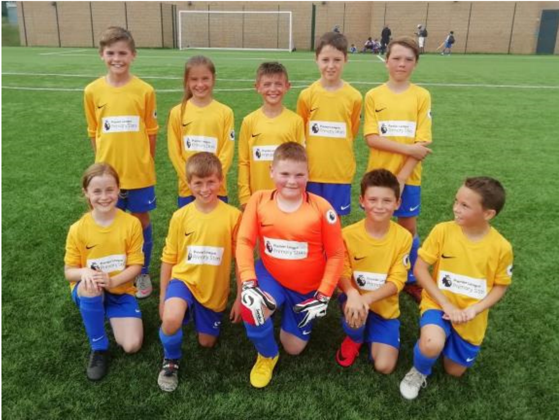
Year 4/5 Mixed Football