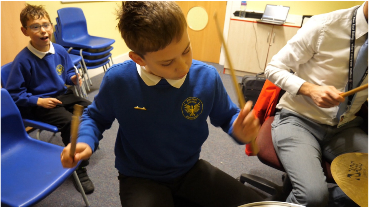
Cool Drumming & Cool Colour Mixing